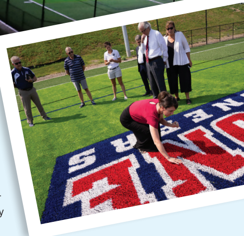
(top) The field is ready for night competition.