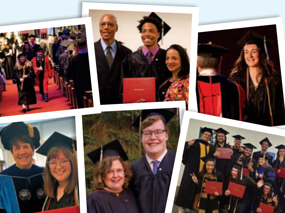
Graduates celebrated with faculty, staff, fellow graduates, and their families.